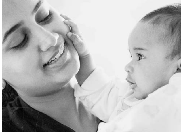
Brahmi helps in calming the nerves and is also a good prenatashpan (sustainer of pregnancy).

While milk and a light diet is recommended during the first month; in the second and third months, milk medicated with life-building herbs such as Vidari, Shatavari (Asparagus), Yashmadhu (Licorice) and Brahmi are prescribed along with honey and ghee.